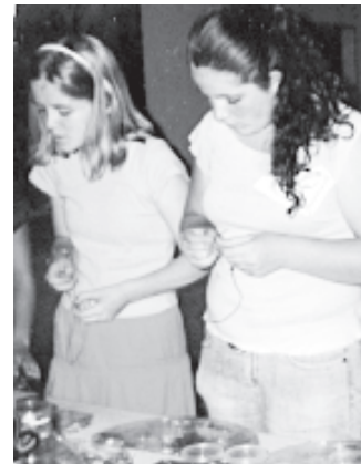
A recent TeenSpace workshop