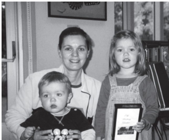
FACES IN THE NEWS: Pictured above is the first family to borrow a pass (available at the Circulation Desk) to Old Westbury Gardens. The pass admits 2 adults and their children. Passes are for use by Port Washington card holders only, and may be borrowed for 3 days. Please note: There is a $2/day overdue charge.