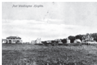
Photographs, postcards, maps, other documents and audiotapes will be available online

benefit genealogists, researchers, students, teachers, authors, and all those who are interested in past and present people, places and events of Port Washington.